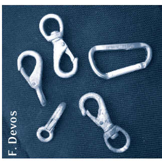
Gate action clips