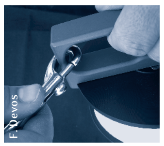
Right way to clip reel

Attachment of the reel can either be in the form of a bolt snap or a double-ended bolt snap. The use of a double-ender is preferred as it allows a diver to remove it while the reel is in use, thus limiting the places where the line can get trapped. If a double-ended bolt snap is used, make sure it is properly secured to the