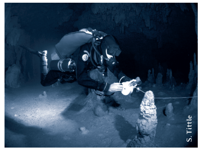
Diver reeling out

Nylon is the material of choice for guidelines. If it were to come loose, a nylon line will sink in the water. A line lying on the floor of the cave is much easier to follow than a line floating on the ceiling. For this reason, polypropylene is not an acceptable choice for a guideline. Nylon also resists the natural elements well and can be left in a cave for many years before