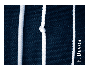
Types of guidelines

abrasion resistance. However, if abrasion is of great concern, some divers may prefer to use a number 36-gauge. At times, when abrasion resistance is less of a concern, explorers will install a high-tensile, thinner, 18-gauge, twisted line. However, beware of thinner lines, as they may not offer sufficient strength, and of thicker lines, which require needlessly large reels or spools. An additional concern with thick guidelines is that they can present a false sense of security and can coax divers farther from the line. This can lead to losing the line as